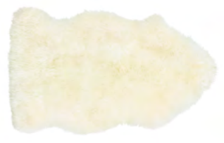
NUZZLER SHEEPSKIN RUG IN NATURAL, £65, LOAF, LOAF.COM