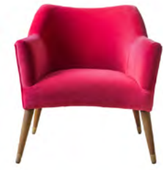
ASTORIA ARMCHAIR IN CORAL VELVET, £399, ATKIN AND THYME, ATKINANDTHYME.CO.UK