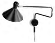
OGILVY SWING ARM WALL LAMP IN MATT BLACK AND ANTIQUE BRASS, £59, MADE.COM