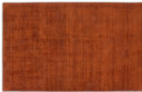
JAGO RUG IN BURNT ORANGE, £199, MADE.COM