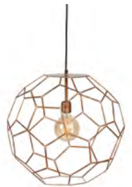
MARRAKESH PENDANT, FROM £117, IT'S ABOUT ROMI, NOXUHOME.COM