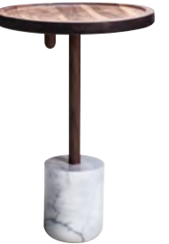
MONOLITHOS SIDE TABLE, £1,075, LUCE DI CARRARA, STORE.WALLPAPER.COM