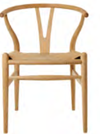
CH24 WISHBONE CHAIR IN SOAPED OAK & PAPER CORD, £647, HANS J. WEGNER AT THE CONRAN SHOP, CONRANSHOP.CO.UK