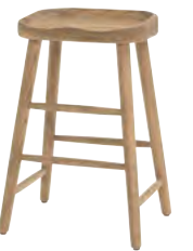
BUMBLE STOOL IN SMOKED OAK, £320 PER PAIR, LOAF, LOAF.COM