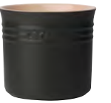
LARGE UTENSIL JAR IN SATIN BLACK, £32, LE CREUSET, LECREUSET.CO.UK