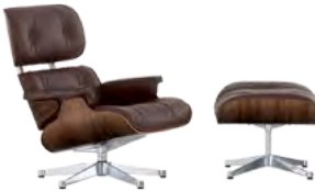
LOUNGE CHAIR & OTTOMAN IN CHOCOLATE LEATHER, £6,205, CHARLES EAMES AT THE CONRAN SHOP, CONRANSHOP.CO.UK