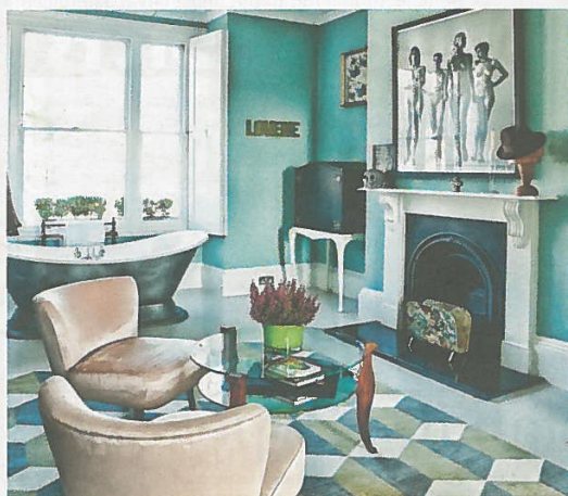
Clockwise from main: Joanna in her kitchen; open shelving for storage and display; a colourful mannequin; a luxurious bathroom; tactile accessories; sociable circular seating