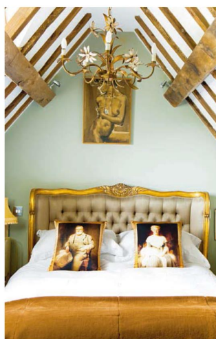
From top Berryman found the sunflower mirror and old trunk in local antiques shops; the bedroom comes complete with his and hers portrait cushions; a view of the 17th-century cottage from the back