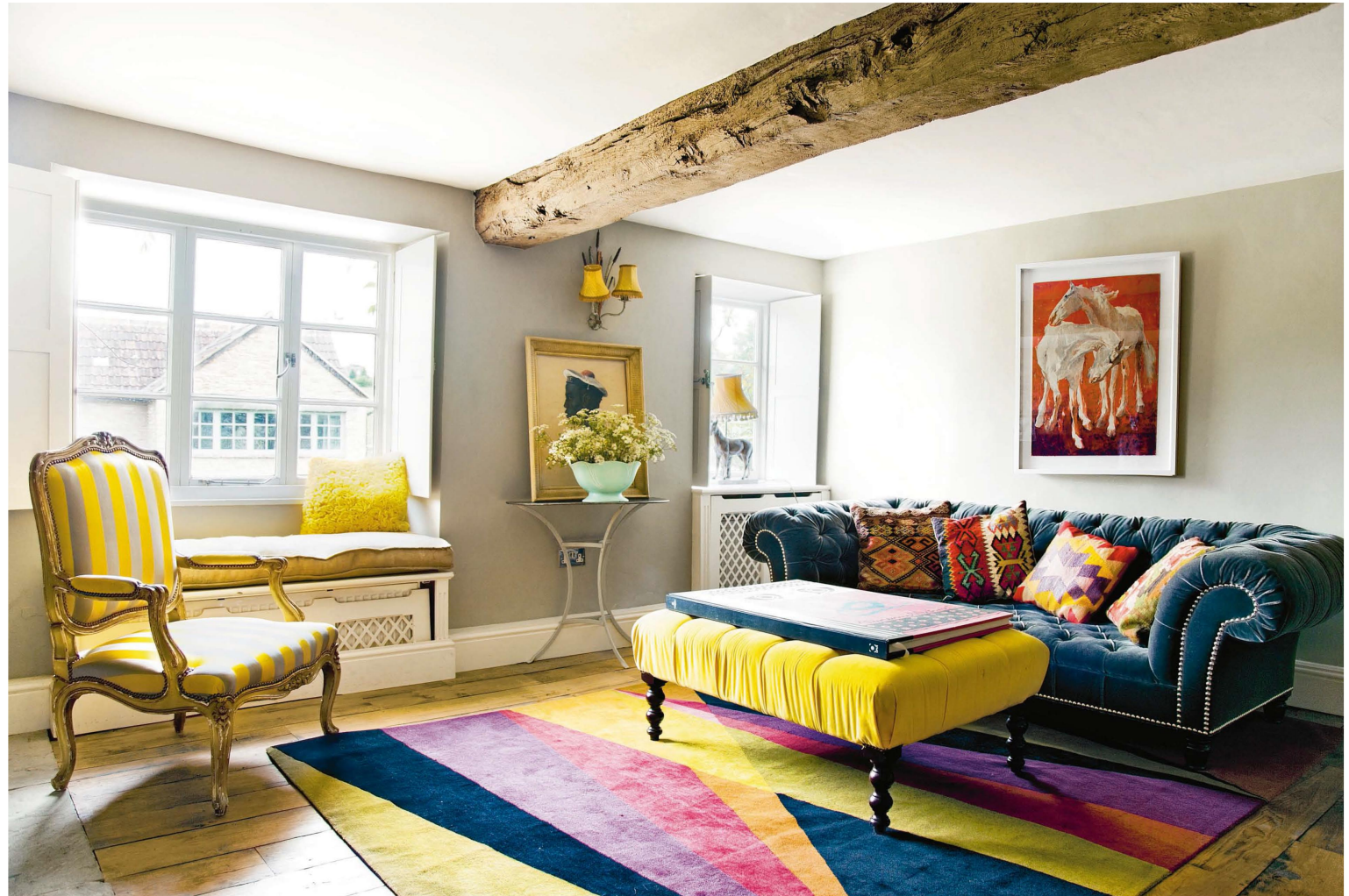
Perfect mismatch Berryman, who likes her interiors bold, pairs a deep-blue sofa with neon-yellow chairs and bright cushions, and throws in some equine antiques for good measure

Now, after gutting the kitchen and adding an extension, completely re-doing the garden, and taking up all the floors, she's got The Folly just the way she wants for a perfect weekend retreat. "I was resolute about having a local flagstone through the entire ground floor, because I felt it was so in keeping - it's like a little Hobbit house, especially when it's well-lit in the winter and you see all the warm lights from within. It's so pretty in the →