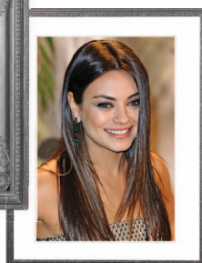
Aston Kutcher and Mila Kunis rented the house while filming in London